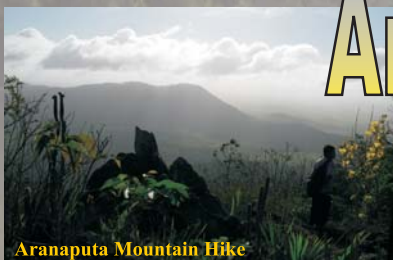
Aranaputa Mountain Hike