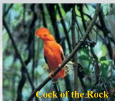
Cock of the Rock