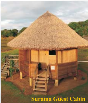
Surama Guest Cabin