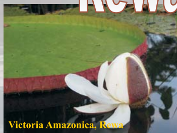
Victoria Amazonica, Rewa

Where the Rupununi and the Rewa Rivers meet, this unique community is an undiscovered jewel.