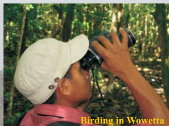
Birding in Wowetta