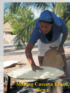
Making Cassava Bread, Rewa

Stay at Rewa's fully equipped eco-lodge or go on a multiple day river expedition into Jaguar country.