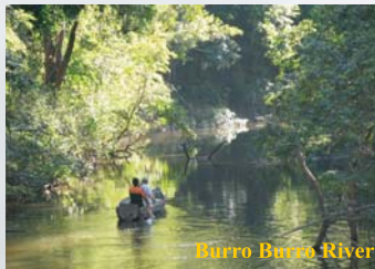
Burro Burro River

River tours on the Burro Burro, mountain hiking, cultural village tours, and wildlife viewing, including fantastic birding opportunities, abound.