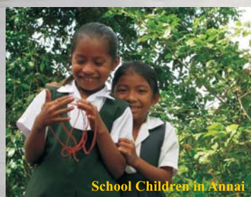
School Children in Annai

Central administrative centre to the region, Annai is home to the largest thatched benab in Guyana. An interactive tour of this picturesque hill top village with traditional clay brick homes makes Annai the perfect place for a cultural walking tour.